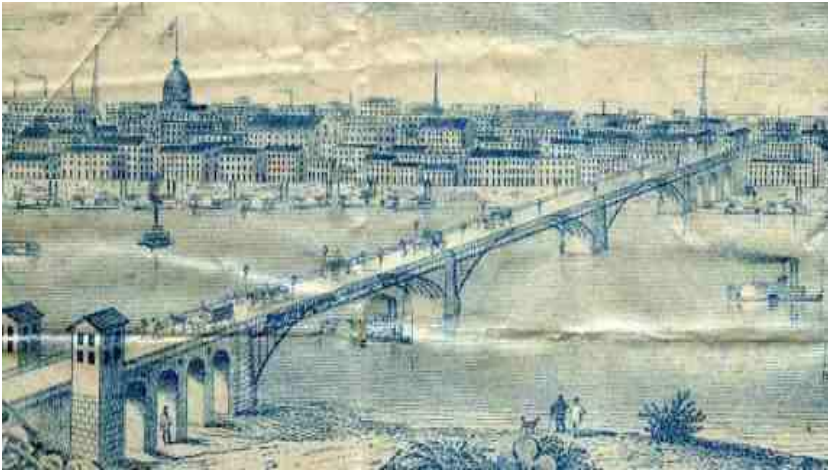
St. Louis 1882